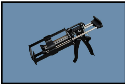
CPE-200 Hand-Held Manual 100ml x 100ml and 100ml x 50ml factory set-up.