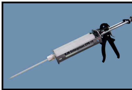
CPE-10 Hand-Held Manual 300ml x 300ml factory set-up, 300ml x150ml, 150ml x 150ml, 150ml x 75ml conversion parts includedd.