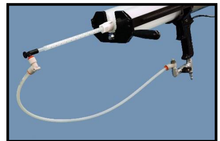
CP-2 Spray Adapter Spray control regulator, air hose and elbow connector included.