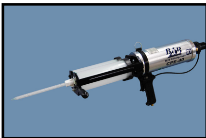
CPE-40 4" Pneumatic Cylinder 750ml x 750ml factory set-up, 300ml x300ml, conversion parts includedd.