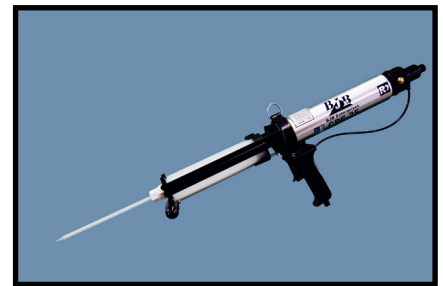
CPE-25 2 1/2" Pneumatic Cylinder 300ml x 300ml factory set-up, 300ml x150ml, 150ml x 150ml, 300ml x 75ml conversion parts includedd.